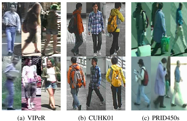
Figure 1: Sample images from VIPeR, CUHK01 and PRID450s datasets. Images on the same column represent the same person.

nifies both feature extraction and pairwise comparison process in a single network.